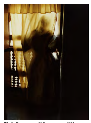
Sibylle Bergemann, Shibam, Jemen 1999 © Estate Sibylle Bergemann/OSTKREUZ. Courtesy Loock Galerie, Berlin