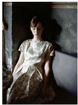
Sibylle Bergemann, Lily, Berlin 2009