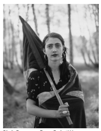
Sibylle Bergemann, Zussa, Berlin 1999 © Estate Sibylle Bergemann/OSTKREUZ. Courtesy Loock Galerie, Berlin