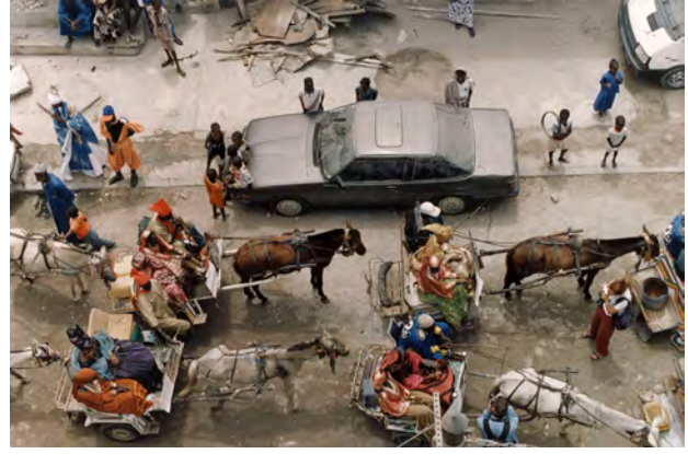
Sibylle Bergemann, Dakar, Senegal 2001