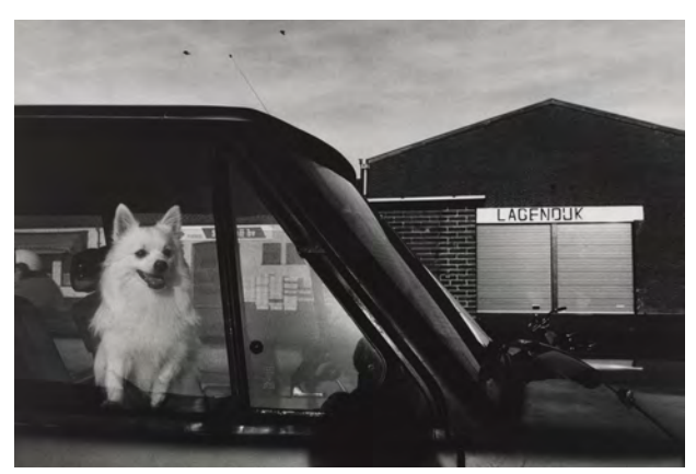
Sibylle Bergemann, Niederlande, 1986 © Estate Sibylle Bergemann/OSTKREUZ. Courtesy Loock Galerie, Berlin