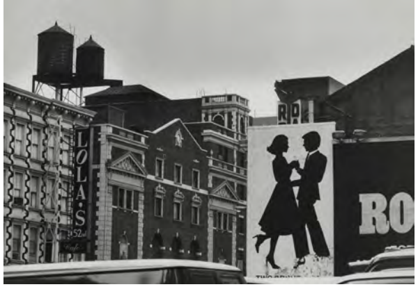
Sibylle Bergemann, New York, 1984