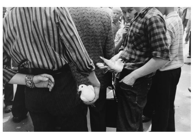
Sibylle Bergemann, Moskau, 1974 © Estate Sibylle Bergemann/OSTKREUZ