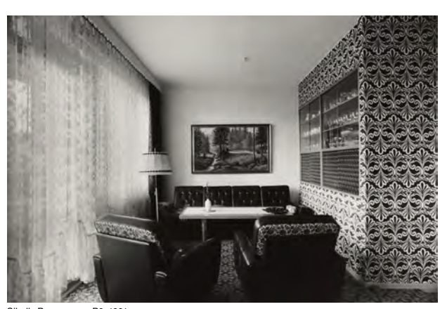
Sibylle Bergemann, P2, 1981 © Estate Sibylle Bergemann/OSTKREUZ