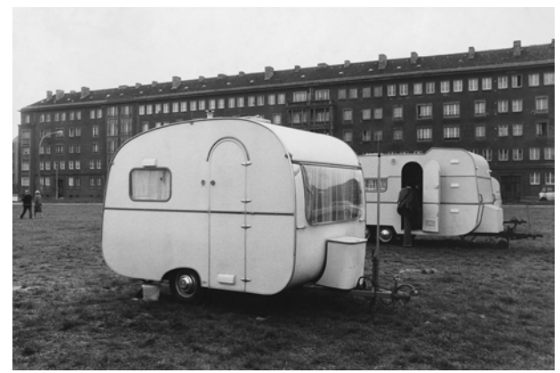
Sibylle Bergemann, Caravan-Ausstellung, Berlin 1980