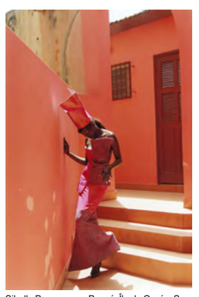
Sibylle Bergemann, Bassé, Île de Gorée, Senegal 2010