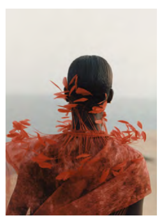
Sibylle Bergemann, Dakar, Senegal 2001