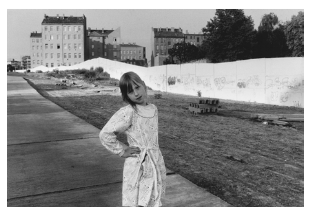
Sibylle Bergemann, Bernauer Straße, Berlin 1990 © Estate Sibylle Bergemann/OSTKREUZ. Courtesy Loock Galerie, Berlin