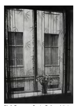
Sibylle Bergemann, Fenster, Berlin, undatiert