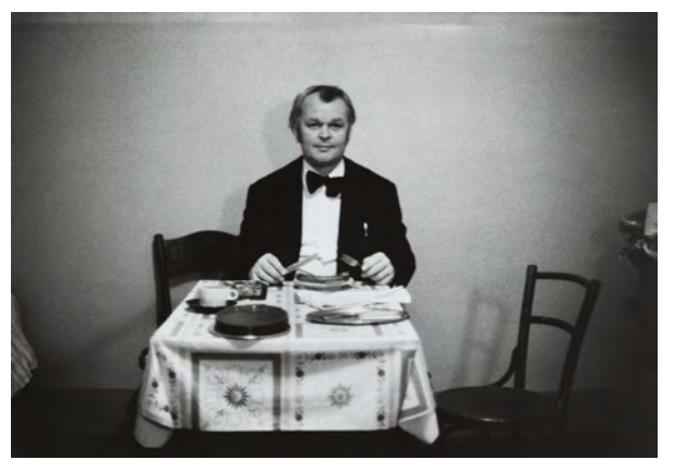
Sibylle Bergemann, Clärchens Ballhaus, Berlin 1976