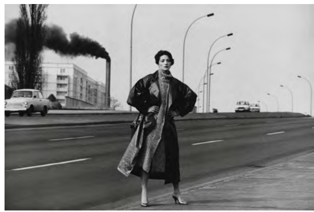
Sibylle Bergemann, Birgit, Berlin 1984