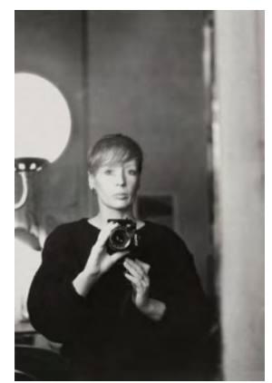
Sibylle Bergemann, Selbstporträt, Schiffbauerdamm, Berlin 1986

Sibylle Bergemann Town and Country and Dogs Photographs 1966 – 2010