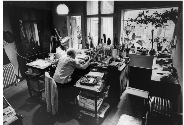
Stefan Moses, Ohne Titel (Hannah Höch in ihrem Haus in Berlin-Heiligensee), 1975

Visitors are taken on a time journey through Berlin in 17 chapters: the era of the Kaisers, the Weimar Republic, Nazi dictatorship, new beginnings after 1945, Cold War in the divided city and alternative lifestyles in both East and West which sprang up in the shadow of the Wall. From the late 1970s, non-conformist subcultures appeared in the art scene of East Berlin, while in West Berlin the Neue Wilden placed the partitioned city back in the