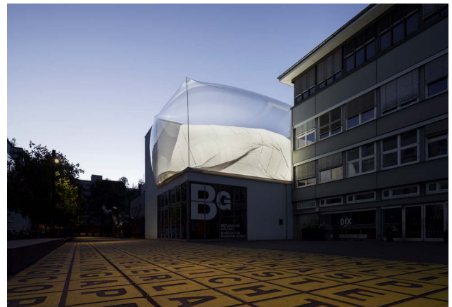
Daniel Hölzl, soft cycles, 2025, Foto: © Clemens Poloczek

Since 2001 the Berlin-based team of landscape architects have designed many gardens across Germany and Europe, not least for prestigious art institutions like the Kulturforum and KW Institute for Contemporary Art in Berlin and Museum Ludwig in Cologne. atelier le balto's first project for the Berlinische Galerie was the "Garden Parade" in 2014. This artistic arboreal arrangement has stood outside Café Dix ever since.