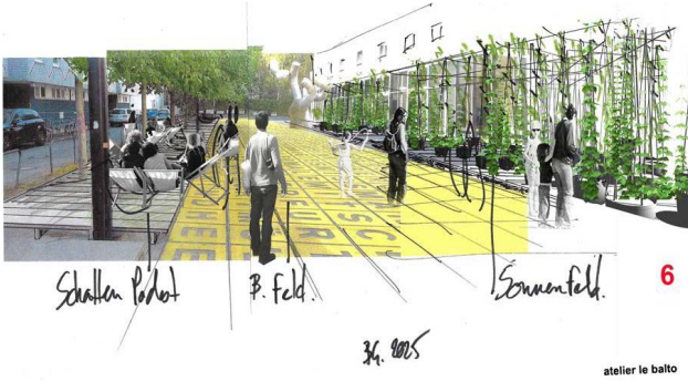
atelier le balto, Skizze Berlinische Galerie, 2025, © atelier le balto