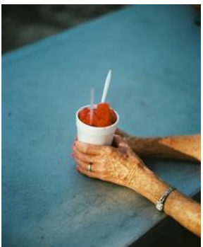
Cyryll Lachauer, The Adventures of a White Middle Class Man (From Black Hawk to Mother Leafy Anderson), No. M3, 2016/2017, © Cyryll Lachauer