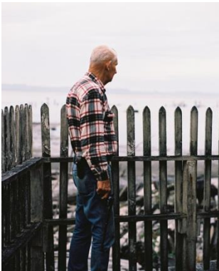
Cyrill Lachauer, The Adventures of a White Middle Class Man - From Black Hawk to Mother Leafy Anderson (No. E1), 2016/2017, © Cyrill Lachauer

Press Conference: 02.11., 11 am, Opening: 02.11., 7 pm