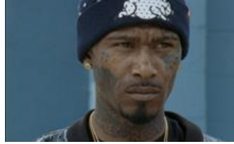
Cyrill Lachauer, Dodging Raindrops – A Separate Reality, 2016/2017, Film Still, © Cyrill Lachauer