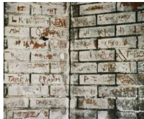
Cyryll Lachauer, The Adventures of a White Middle Class Man (From Black Hawk to Mother Leafy Anderson), No. L2, 2016/2017, © Cyryll Lachauer