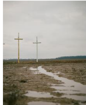
Cyryll Lachauer, The Adventures of a White Middle Class Man (From Black Hawk to Mother Leafy Anderson), No. C2, 2016/2017