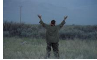
Cyrill Lachauer, Dodging Raindrops – A Separate Reality, 2016/2017, Film Still, © Cyrill Lachauer