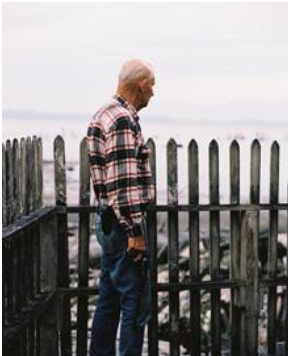
Cyryll Lachauer, The Adventures of a White Middle Class Man (From Black Hawk to Mother Leafy Anderson), No. E1, 2016/2017, © Cyryll Lachauer