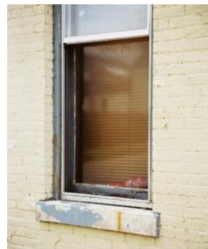
Cyryll Lachauer, The Adventures of a White Middle Class Man (From Black Hawk to Mother Leafy Anderson), No. K2, 2016/2017, © Cyryll Lachauer