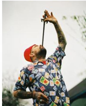
Cyryll Lachauer, The Adventures of a White Middle Class Man (From Black Hawk to Mother Leafy Anderson), No. M1, 2016/2017, © Cyryll Lachauer