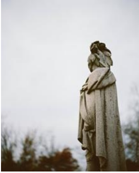
Cyrill Lachauer, The Adventures of a White Middle Class Man (From Black Hawk to Mother Leafy Anderson), No. A2, 2016/2017, © Cyrill Lachauer