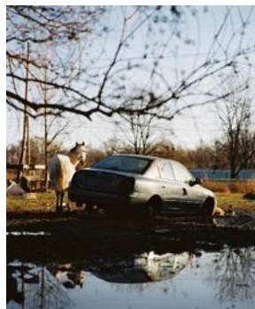
Cyryll Lachauer, The Adventures of a White Middle Class Man (From Black Hawk to Mother Leafy Anderson), No. I2, 2016/2017, © Cyryll Lachauer