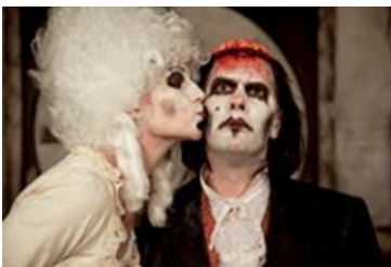
John Bock, Der magische Krug , 2013, © John Bock, courtesy Sprüth Magers, photo: Martin Schlecht

John Bock In the Moloch of the Presence of Being 24.02–21.08.2017 Press conference: 23.02, 11 am, opening: 23.02, 7 pm