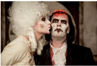
John Bock, Der magische Krug , 2013, Video, 15:50 Min. (Part of the installation Der magische Krug , 2013) © John Bock, Courtesy Sprüth Magers, Photo: Martin Schlecht