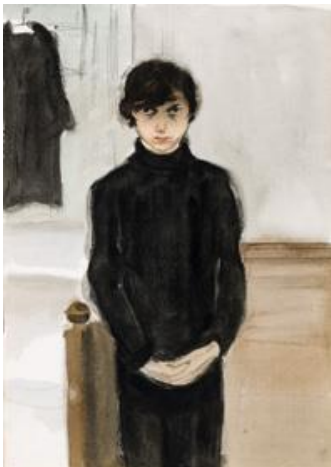
Jeanne Mammen, untitled (self-portrait), undated (c. 1926), Förderverein der Jeanne-Mammen- Stiftung e.V., © VG BILD-KUNST Bonn, 2017

Press conference: 4.10, 11 am, Opening: 5.10, 7 pm